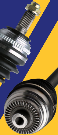
European Flat Spline Design*