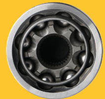
8 Ball Socket*