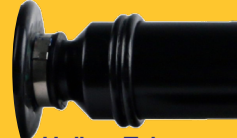
Hollow Tube Design*