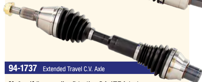
94-1737 Extended Travel C.V. Axle

Note: If “upgrading” to the 94-1754 (or) 94-1737, the CV Axles should be installed in pairs (left & right) to ensure proper performance.