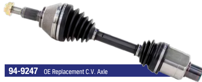
94-9247 OE Replacement C.V. Axle

We strongly recommend replacing the C.V. Shaft with a new NAPA 94-9247, 94-1754 or 94-1737 when completing the job.