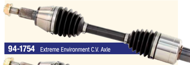
94-1754 Extreme Environment C.V. Axle